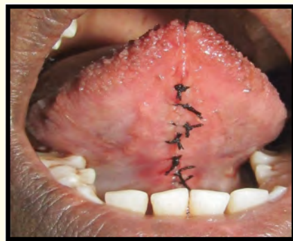
Figure 6: Sutures in place.

During the procedure there was minimal bleeding which was controlled with pressure. The patient was advised to resume normal soft diet for a week. To avoid any post-operative discomfort, the patient was prescribed antibiotics and analgesics were for three days. Good initial healing was observed after one week of sutures removal (Figure 7). It was observed that there was significant improvement in speech and substantial gain in tongue protrusion when compared with pre-operative measures (Figure 8).