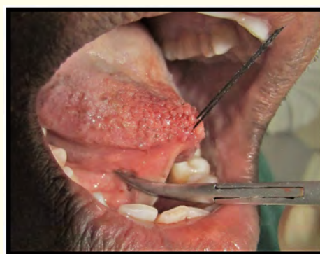
Figure 3: Frenectomy incision above and below the curved hemostat.

Scalpel method was used to perform the procedure. A curved hemostat was inserted to the bottom of the lingual frenum at the depth of the vestibule and was then clamped into position (Figure 3). It is followed by giving two incisions at the superior and the inferior aspect of the haemostat. The intervening Frenum was sectioned out using No. 11 surgical blade and a diamond shape wound was obtained (Figure 4).