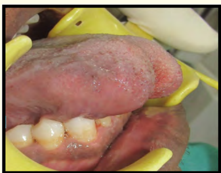
Figure 2: Pre-operative view showing.