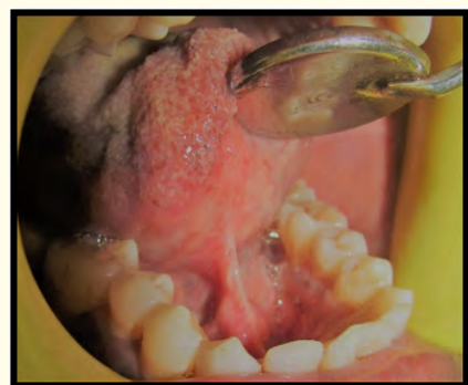
Figure 7: 1 week after suture removal.

During the procedure there was minimal bleeding which was controlled with pressure. The patient was advised to resume normal soft diet for a week. To avoid any post-operative discomfort, the patient was prescribed antibiotics and analgesics were for three days. Good initial healing was observed after one week of sutures removal (Figure 7). It was observed that there was significant improvement in speech and substantial gain in tongue protrusion when compared with pre-operative measures (Figure 8).