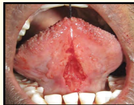
Figure 4: Diamond shaped wound was obtained after removing the frenum.

A Complete dissection was done by separating the fibers to achieve a good tension free closure of the margins (Figure 5). The Sutures were placed at an equal distance & care was taken to try and avoid any adjacent vital structures (Figure 6). This primary closure of wound reduces scar formation.