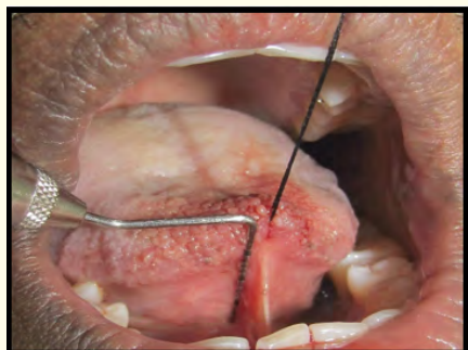
Figure 1: Pre-operative view showing ankyloglossia Extension of tongue.

A 49 year old male reported to the Department of Periodontics, with a chief complaint of difficulty in speech and incomplete protrusion of the tongue. On general examination of the patient, he appeared normal. There was no relevant Medical history. After a thorough, intraoral examination the patient was diagnosed as Class III ankyloglossia by Kotlow's assessment (Figure 1 and 2). He was able to protrude the tongue up to the lower lip. The patient did not show any malocclusion nor had any progressive gingival recession in relation to mandibular incisors. Surgical frenectomy of the lingual frenum was planned. The patient was informed about the treatment procedure and informed consent was obtained preoperatively.