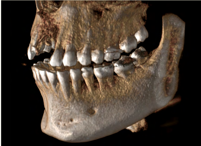
Figure 2: Accessory mental foramina.