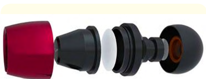
Figure 1: Test will be used for this study.

many types of acoustic filters available in the market. The Acoustic filters used in this study are stock ready made In-Ear filters and are of a passive type (Figure 1). The device is an EPA certified product with a passive NRR Rating of 12dB (Figure 2). A questionnaire has been constructed consisting of 2 pages. The test subject was required to answer page 1 of the questionnaire prior to wearing the device and page 2 after using it for a minimum of 30 minutes. The data collected will be analysed using IBM® SPSS® Statistics v24.0. Frequencies and McNemar test will be used for this study.