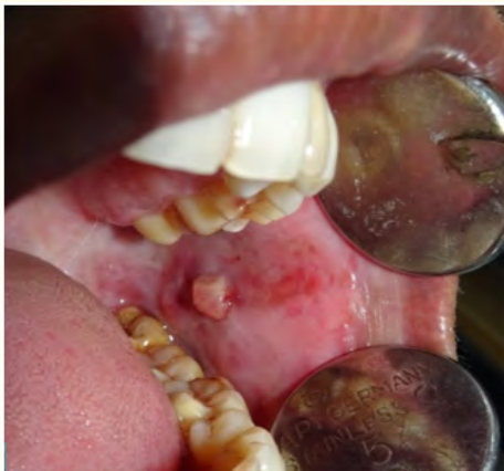
Figure 1: Pre-operative image. Focal Fibrous Growth on buccal mucosa in relation to 26, 27, 36, 37.

On intraoral examination, the patient was found to have Oral Submucosal Fibrosis (Grade 1) with a solitary, well circumscribed, firm in consistency, smooth surfaced, pedunculated, tender growth over left buccal mucosa at the occlusal plane level, opposite molar tooth region, measuring approximately 0.5 - 0.6 cm. (Figure 1). No tooth showed tenderness on percussion.