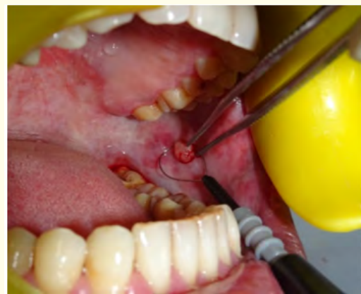
Figure 3: Loop electrode in position during electrocautery procedure.