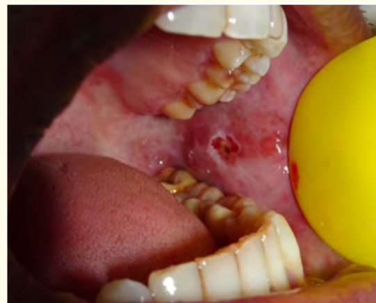
Figure 4: Fibroma excision done with electrocautery.