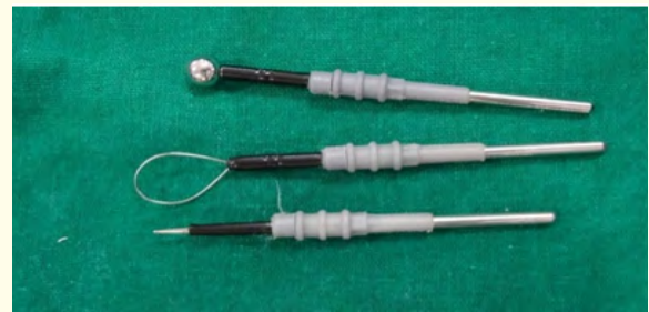
Figure 2: Electrocautery electrodes used in the procedure.

After phase 1 therapy, surgical excision of the fibroma was planned with the use of electrocautery. Scaling was done on the day of surgery to remove any soft deposits. Complete blood count, Blood pressure and pulse rate was examined to be within normal range. After obtaining informed consent from the patient, topical anesthetic agents (2% lignocaine hydrochloride and 1:2,00,000 adrenaline) was infiltrated around the surgical site. After profound anesthesia was achieved, excision of fibroma was done with the loop and needle shaped electrodes and coagulation was achieved by ball electrode (Figure 2-4). Charred tissue was removed from the surgical site via surgical scissors to achieve healthy margins for proper healing.