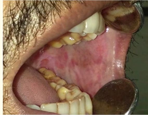
Figure 7: Post-operative image after 2 weeks follows up.

Postoperative healing was found to be uneventful. No pain, discomfort or difficulty in eating was reported by the patient on recall after 2 weeks (Figure 7).