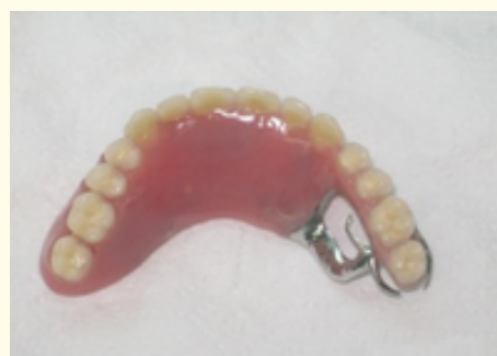
Figure 11: Final prosthesis, occlusal view.

The processed removable prosthesis was delivered to the patient, occlusion refined, and postoperative instructions were given (Figure 11-14). The bilateral balanced occlusal scheme was designed for better stability [8,9]. The patient was very satisfied with the appearance and comfort of the prosthesis and demonstrated an improved oral hygiene and a more positive state of mind.