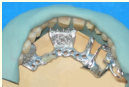
Figure 10: Verification of clearance.

In the later appointment, the framework was tried-in, while the gold bar was screwed to the implants. The artificial teeth were then transferred to the framework by using the index, tried-in for proper esthetics and accuracy of occlusal relations, and returned to the laboratory for final processing.