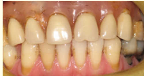
Figure 4: Interim RPD after 5 years.

At this stage of the treatment, the patient experienced another episode of severe depression caused by his PTSD and did not pursue his treatment for another 5 years. The implants were still in an acceptable condition, but there was a significant soft tissue loss during this period. His oral hygiene had been poor and some of his mandibular teeth had advanced dental caries (Figure 4).