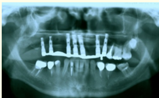
Figure 14: Postoperative panoramic radiograph.