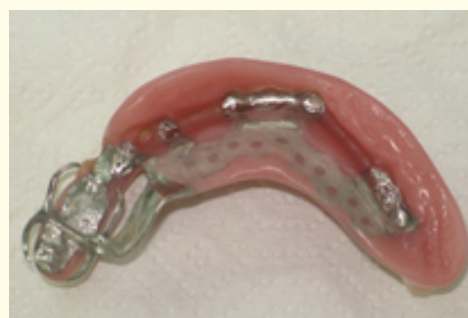
Figure 12: Final prosthesis, intaglio.