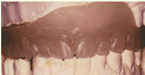
Figure 2: Radiographic guide.

The initial treatment plan was to fabricate a maxillary implant-supported fixed prosthesis. The interim RPD was duplicated and used as a radiographic (Figure 2). The available bone dimensions were evaluated on the CT-scan, the radiographic guide was modified accordingly to be used as a surgical guide, and finally, seven implants were placed in his maxillary arch (Branemark, Noble Biocare) (Figure 3).