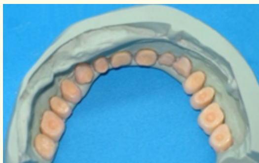
Figure 7: Transfer of teeth the index.

To minimize the stresses on his soft tissue and for optimum distribution of the forces, a bar was designed and verified for adequate clearance by means of the silicon index. After casting the bar with Type IV gold alloy (SM 55, Strategy Milling) and intraoral verification, it was returned to the cast (Figure 8), the undercuts were blocked by utility wax, and duplicated by an addition-vulcanizing duplication silicon material (Z-Dupe, Henry Schein). A duplicate cast was poured, and the silicon index with artificial teeth in position was tried and inspected for the precision of fit. The cast and the silicon index were then sent to the dental laboratory for fabrication of RPD framework.