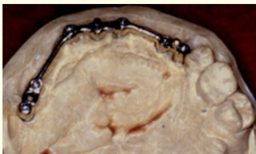
Figure 8: Gold bar.

To minimize the stresses on his soft tissue and for optimum distribution of the forces, a bar was designed and verified for adequate clearance by means of the silicon index. After casting the bar with Type IV gold alloy (SM 55, Strategy Milling) and intraoral verification, it was returned to the cast (Figure 8), the undercuts were blocked by utility wax, and duplicated by an addition-vulcanizing duplication silicon material (Z-Dupe, Henry Schein). A duplicate cast was poured, and the silicon index with artificial teeth in position was tried and inspected for the precision of fit. The cast and the silicon index were then sent to the dental laboratory for fabrication of RPD framework.