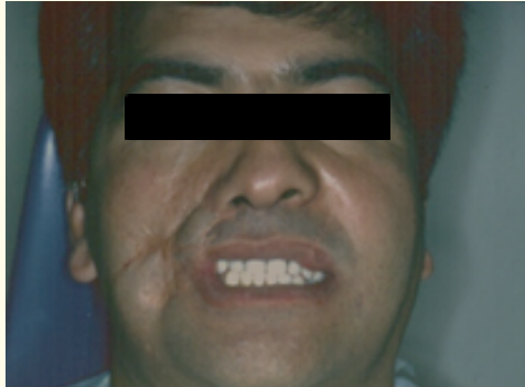
Figure 1: Maxillary interim RPD in place.

At the tooth try-in appointment, esthetic, phonetic, VDO, and patient’s subjective opinion were assessed. The processed maxillary interim RPD was delivered, and the adjustments were done where needed (Figure 1).