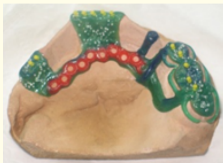
Figure 9: Framework wax-up.

The framework was waxed up and cast, using the silicon index with the artificial teeth in their position, for verification of the proper clearance (Figure 9,10).