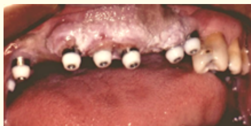
Figure 3: Maxillary implants in position.

At this stage of the treatment, the patient experienced another episode of severe depression caused by his PTSD and did not pursue his treatment for another 5 years. The implants were still in an acceptable condition, but there was a significant soft tissue loss during this period. His oral hygiene had been poor and some of his mandibular teeth had advanced dental caries (Figure 4).