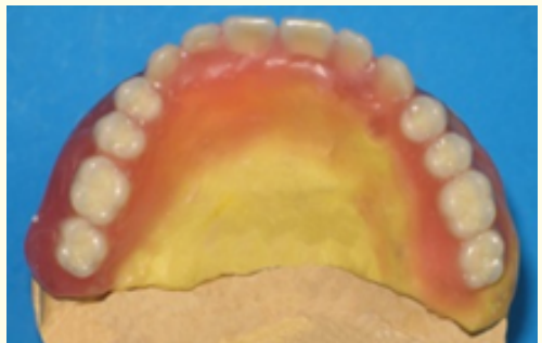
Figure 5: Tooth arrangement.

An open-tray impression of the implants was made, a record base was fabricated on the master cast, and new intraoral records were made. The master cast was then mounted in centric relation, a new tooth arrangement was tried-in, and an index was made with a silicon putty (Speedex, Coltene) (Figure 5-7).