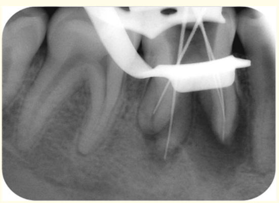
Figure 21: Working length IOPA radiograph of tooth #46 with mesial angulation.