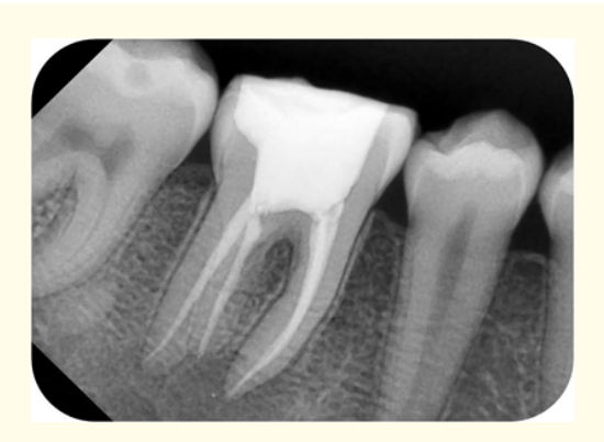
Figure 27: Post obturation IOPA radiograph of tooth #46.

Rubber dam was applied after administration of local anaesthesia. Access cavity preparation was done and modified to locate all four-canal orifice. Working length confirmed with electronics apex locator due to restricted mouth opening. Canal preparation was done with flexi hand NiTi files and Protaper universal rotary files. Root canals were copiously irrigated during entire cleaning and shaping procedure using 5% sodium hypochlorite followed by saline. No pus drainage was seen from root canal. After a week when patient was asymptomatic obturation was done and postoperative radiograph was taken (Figure 27). Post endodontic restoration was done in tooth #46 and patient was recalled for treatment of OSMF after a week but he did not reported back for further treatment.