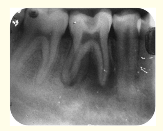
Figure 18: Preoperative IOPA radiograph of tooth #46 with straight on angulation.