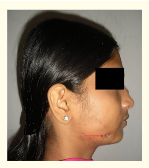
Figure 9: Post-operative photograph of patient (right side profile).