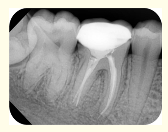
Figure 7: Post obturation IOPA radiograph of tooth #46 with straight on angulation.