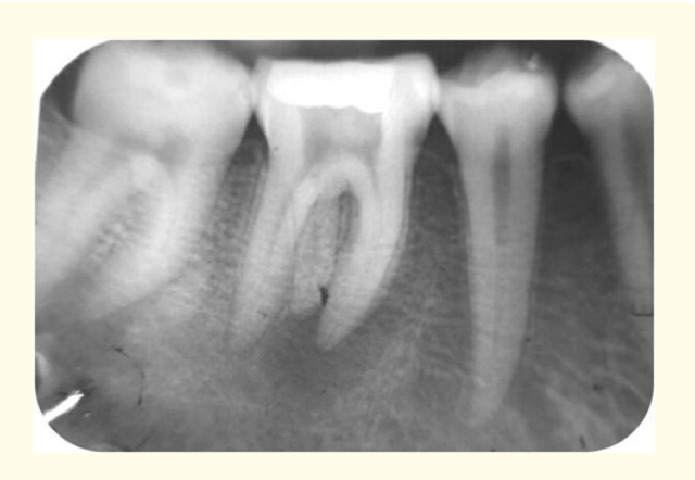
Figure 26: Preoperative IOPA radiograph of tooth #46 with straight on angulation.

Rubber dam was applied after administration of local anaesthesia. Access cavity preparation was done and modified to locate all four-canal orifice. Working length confirmed with electronics apex locator due to restricted mouth opening. Canal preparation was done with flexi hand NiTi files and Protaper universal rotary files. Root canals were copiously irrigated during entire cleaning and shaping procedure using 5% sodium hypochlorite followed by saline. No pus drainage was seen from root canal. After a week when patient was asymptomatic obturation was done and postoperative radiograph was taken (Figure 27). Post endodontic restoration was done in tooth #46 and patient was recalled for treatment of OSMF after a week but he did not reported back for further treatment.