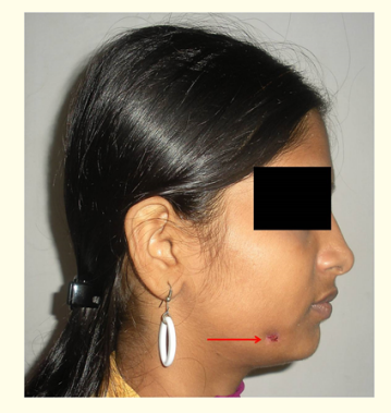
Figure 1: Preoperative extra oral photograph of patient (right side profile) showing extraoral scaring of tissues.