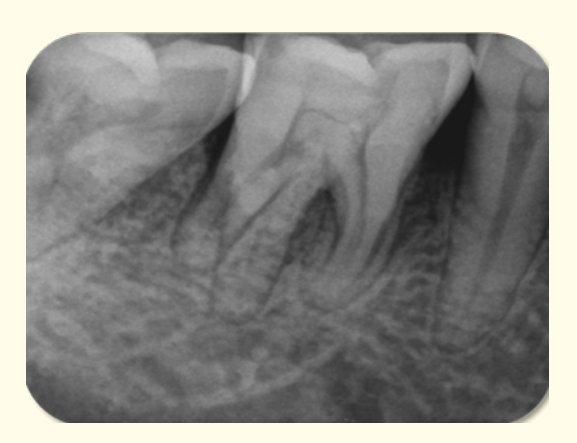
Figure 12: Preoperative IOPA radiograph of tooth #46.

Rubber dam was applied after securing local anaesthesia for tooth #46. Access cavity preparation was done and four canal orifices i.e. MB, ML, DB and DL were explored. Working length IOPA radiograph was taken (Figure 13) and confirmed with electronics apex locator. All four canals were prepared using hand files and rotary Protaper universal files. Canal preparation was completed sequentially upto 6% no.20, F1 Protaper file. Root canals were copiously irrigated during entire cleaning and shaping procedure using 5% sodium hypochlorite followed by saline and irrigant was agitated with ultrasonics. Intracanal calcium hydroxide was placed and patient was recalled after 2 weeks. In next visit, pus drainage was not evident and patient was asymptomatic. After removal of calcium hydroxide, canals were dried using Protaper paper point and obturation was done using 6% Protaper gutta percha with AH plus sealer. Warm vertical condensation was done to seal canals optimally and post-operative radiograph was taken (Figure 14). Post endodontic restoration with amalgam was done in tooth #46 after a week. After 1-month recall, no nodule was seen except small depressed area in front profile (Figure 15,16).