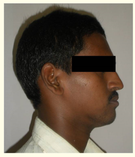
Figure 15: Post-operative photograph of patient (right side profile).