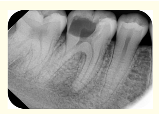
Figure 4: Preoperative IOPA radiograph of tooth #46.