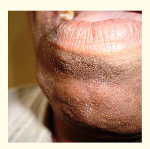
Figure 24: Pre-operative photograph of patient (front profile) showing elevated nodular swelling on mandibular right side.