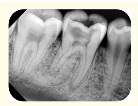
Figure 28: Preoperative IOPA radiograph of tooth #46 with straight on angulation.

After local anaesthesia rubber dam was applied and access cavity was prepared to locate all four-canal orifice. Working length confirmed with electronics apex locator due to restricted mouth opening. Canal preparation was done with flexi hand NiTi files and rotary Protaper files. Root canals were copiously irrigated during entire cleaning and shaping procedure using 5% sodium hypochlorite. Patient recalled for obturation after a week. In the next visit, obturation was done and post-operative radiograph was taken (Figure 29). Patient was scheduled for post endodontic in tooth #46 after a week.