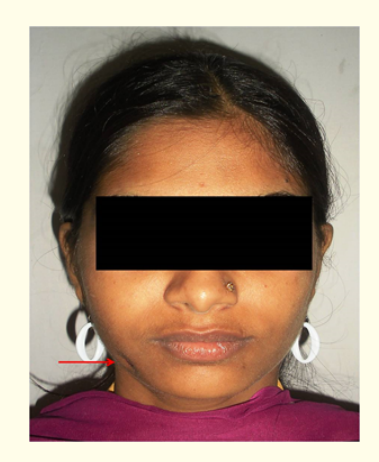
Figure 2: Preoperative extra oral photograph (front profile) of patient showing depressed area in mandibular right-side due to contracture of skin.

A 21-year-old healthy female patient from a remote village was reported to the Department of Conservative Dentistry and Endodontics, complaining of pus discharge from external skin surface of right cheek region since 1 week. Patient narrated that, she had pain 6 months back in tooth #46 for which she had visited a physician. The physician prescribed her antibiotics and analgesics for relieving her symptoms. Again, after a month she has noticed a small nodule on her right cheek. With time, the nodule has increased to about 1 cm in size in a month and pus drainage was observed through the nodule. She had then visited to a general surgeon, where the surgeon did curettage of nodular area from external skin surface. Patient was asymptomatic upto next month till she observed recurrent pus drainage from the operated site. The surgeon has then noticed a carious tooth #46 and referred the patient for dental treatment to our department. When the patient visited our department, a visible granulation tissue with small depressed area was observed in operated site of right cheek (Figure 1,2). Intra oral examination showed carious tooth #46 (Figure 3). Electric pulp test showed no response in tooth #46 and suggested pulp necrosis. IOPA radiograph showed three rooted tooth #46 and diagnosed as radix entomolaris with extraoral draining sinus in right buccal mucosa (Figure 4). Patient was explained about the condition and her informed consent was obtained for root canal treatment of tooth #46.