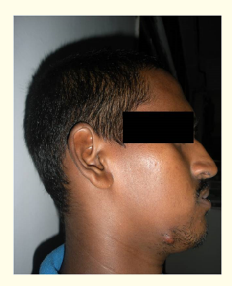
Figure 10: Preoperative extra oral photograph of patient (right side profile) showing extraoral nodule.

Extraoral examination of patient showed a small nodule from skin surface of the right cheek (Figure 10,11). Intra oral examination showed carious tooth #46. IOPA radiograph showed tooth #46 with 3 roots (Figure 12). Electric pulp test showed no response, thus identified as necrosis of the pulp in tooth #46. Patient was thus diagnosed as radix paramolaris with tooth #46 with extraoral draining sinus in right buccal mucosa. Patient explained about the condition and his informed consent was obtained for root canal treatment in tooth #46.