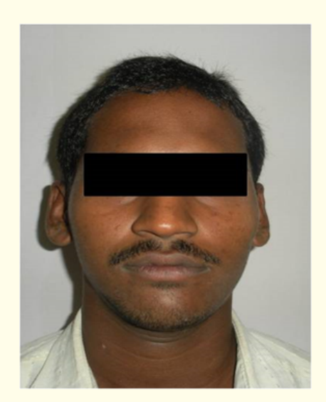
Figure 16: Post-operative photograph of patient (Front profile).