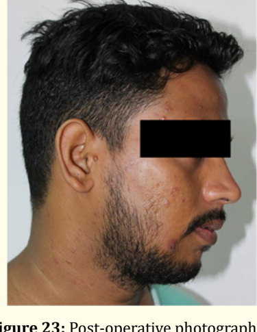
Figure 23: Post-operative photograph of patient (right side profile) showing resolution of sinus tract.