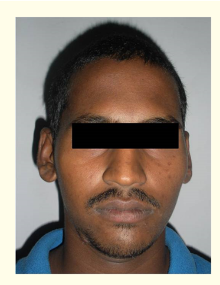
Figure 11: Preoperative extra oral clinical photograph front profile of patient showing elevated area in mandibular right side.