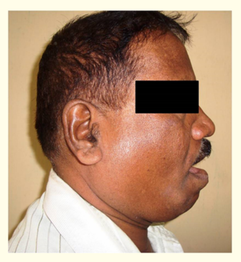
Figure 25: Pre-operative photograph of patient (right side profile) showing elevated nodular swelling on mandibular right side.