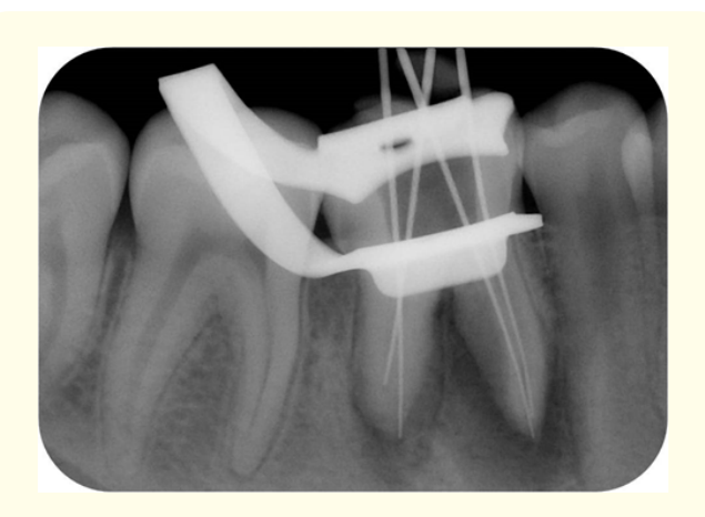
Figure 20: Working length IOPA radiograph of tooth #46 with straight on angulation.

endodontic restoration in tooth #46 after a week shown showed resolution of sinus tract (Figure 23).