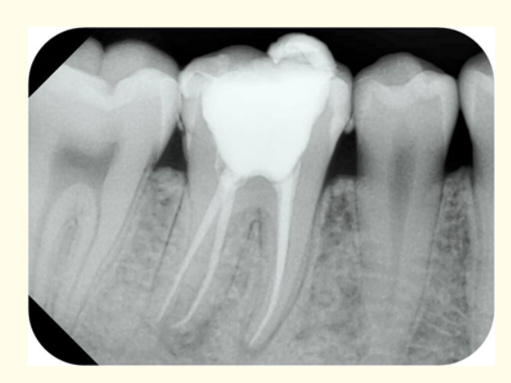
Figure 29: Post obturation IOPA radiograph of tooth #46.

After local anaesthesia rubber dam was applied and access cavity was prepared to locate all four-canal orifice. Working length confirmed with electronics apex locator due to restricted mouth opening. Canal preparation was done with flexi hand NiTi files and rotary Protaper files. Root canals were copiously irrigated during entire cleaning and shaping procedure using 5% sodium hypochlorite. Patient recalled for obturation after a week. In the next visit, obturation was done and post-operative radiograph was taken (Figure 29). Patient was scheduled for post endodontic in tooth #46 after a week.