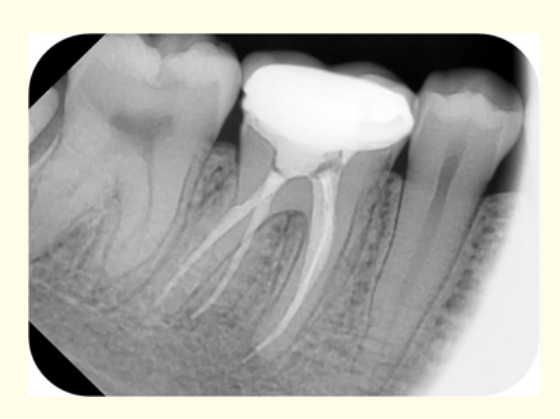
Figure 8: Post obturation IOPA radiograph of tooth #46 with distal angulation.