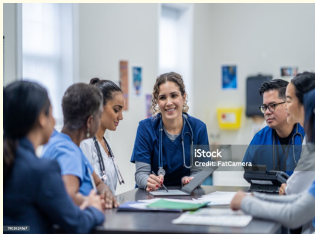
Figure 2: ( https://www.istockphoto.com/photo/medical-team-meeting-gm1903424167-554391341?utm_campaign=srp_photos_40&utm_content=https%3A%2F%2Fwww.pexels.com% ).

Furthermore, nursing research informs the assessment and evaluation of student learning. Research helps identify effective methods for evaluating student performance and understanding. By using evidence-based assessment strategies, educators can ensure that students are meeting the learning objectives of the curriculum and are prepared for clinical practice [4].