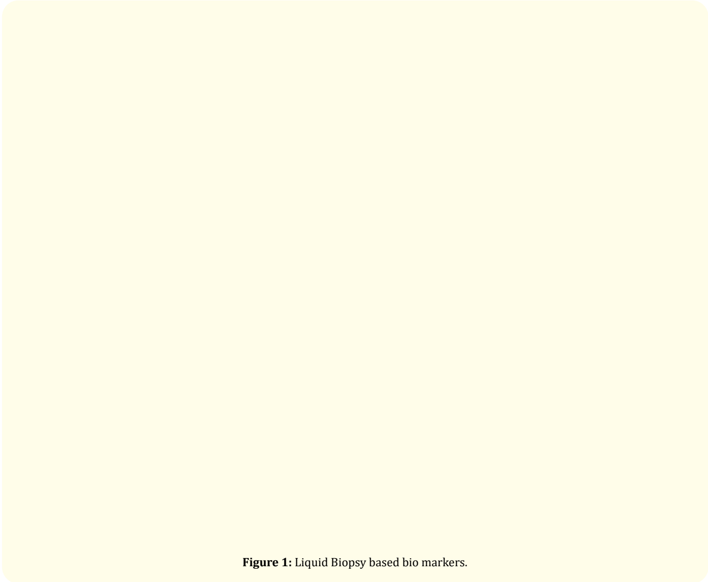
Figure 1: Liquid Biopsy based bio markers.