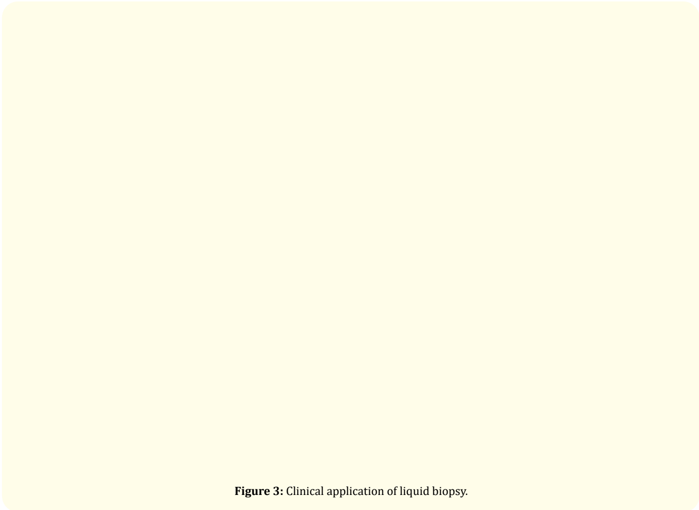
Figure 3: Clinical application of liquid biopsy.