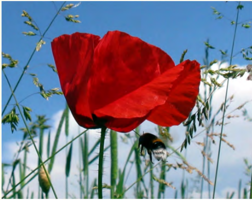
Figure 1: Photo of poppy and bee.