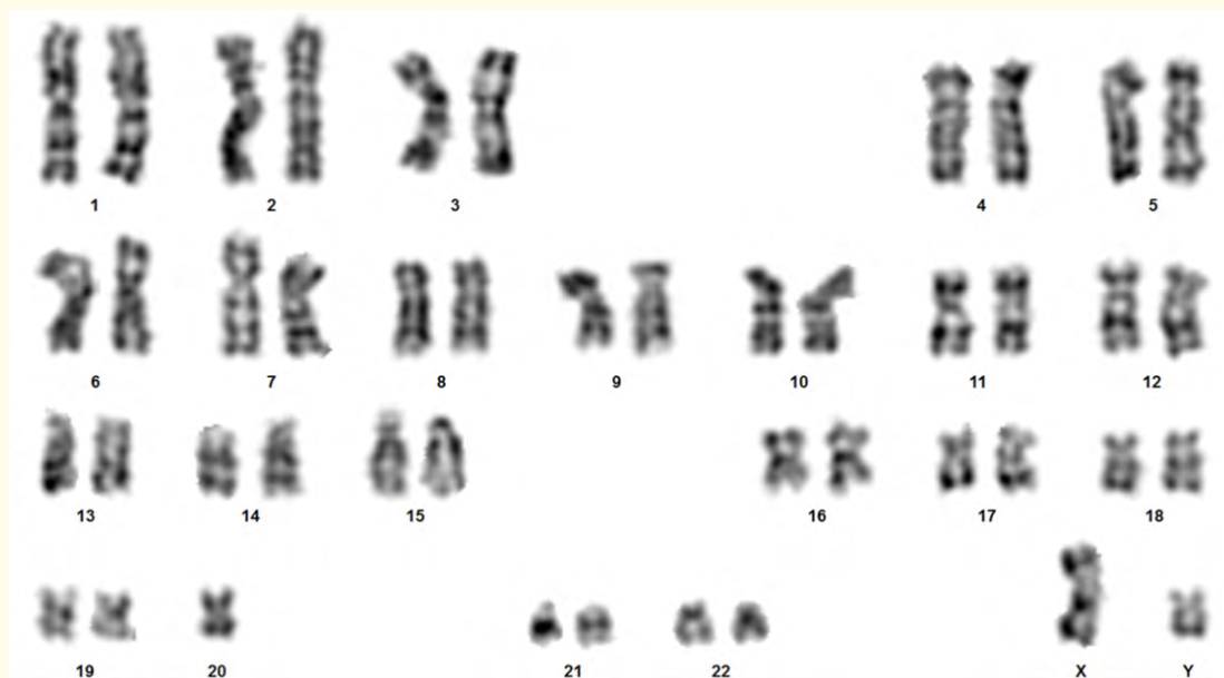
Figure 2: GTG- Banded Karyotype showing evidence of Monosomy 20 (45,XY,-20).