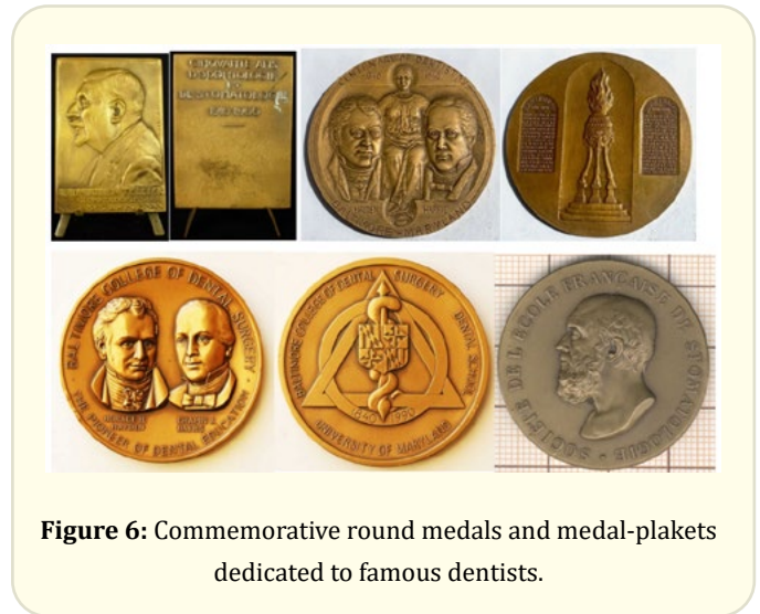
Figure 6: Commemorative round medals and medal-plakets dedicated to famous dentists.