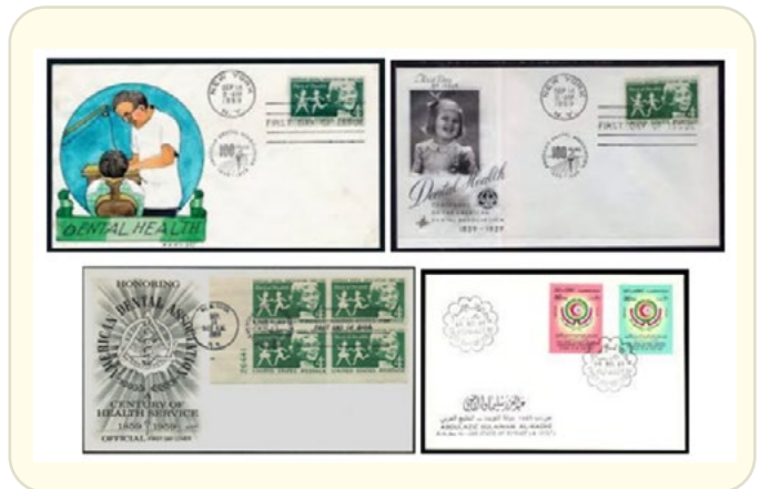
Figure 4 shows a small selection of 14 artistic labeled envelopes and postmarks on a dental theme [2-9].