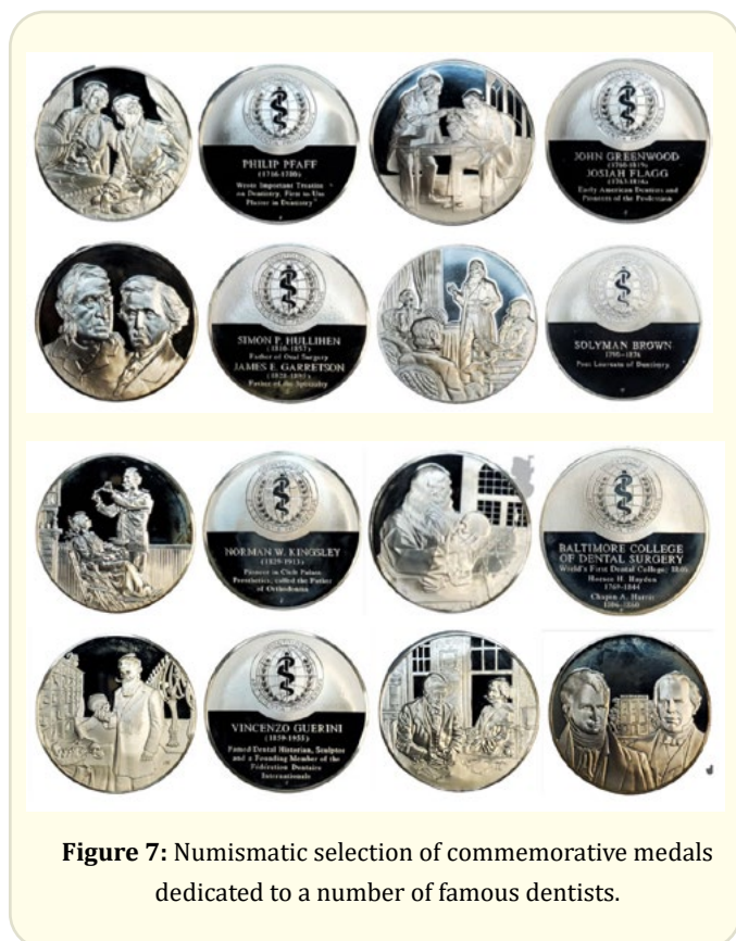
Figure 7: Numismatic selection of commemorative medals dedicated to a number of famous dentists.

This concludes another new author's research article, thematically dedicated to dentistry, its everyday life and heroes. The author is preparing for publication new materials on this topic, which will be published in the near future.