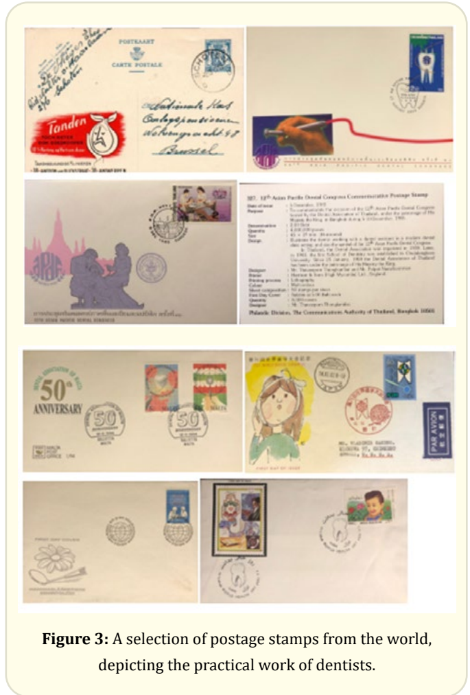
Figure 3: A selection of postage stamps from the world, depicting the practical work of dentists.

Figure 4 shows a small selection of 14 artistic labeled envelopes and postmarks on a dental theme [2-9].