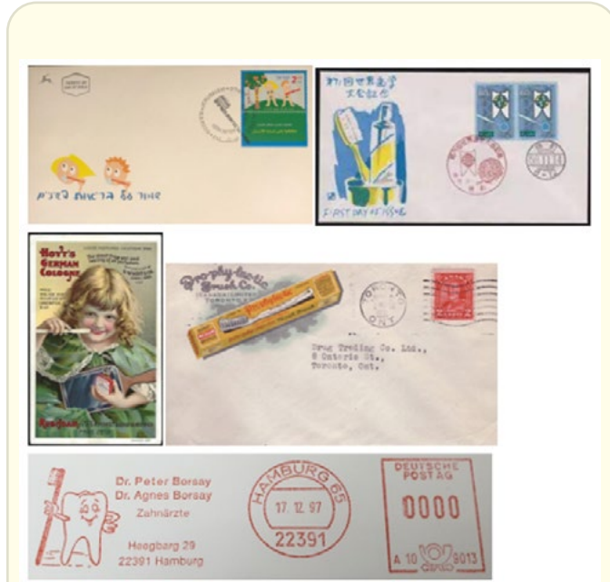
Figure 5: A selection of philatelic materials dedicated to dental care and oral hygiene.

Thematic Figure 6 presents a numismatic selection of commemorative medals dedicated to both dentistry and famous scientists and dentists from different countries and historical periods - Medal Dentist Jean Deliberos Orthodontic Ondothologie (1960); Chapis A. Harin and Horace H. Hayden; Charles Gustave Of Marey and a number of other famous dentists [10].