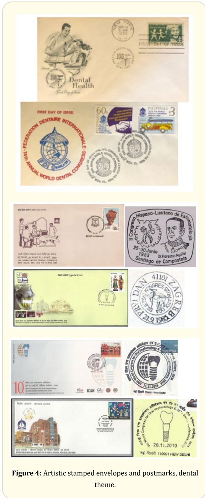
Figure 4: Artistic stamped envelopes and postmarks, dental theme.

The following thematic philatelic selection of postage stamps, postal block, postcards and envelopes presents various subjects dedicated to both dental care and dental and oral hygiene – Figure 5 [2-9].