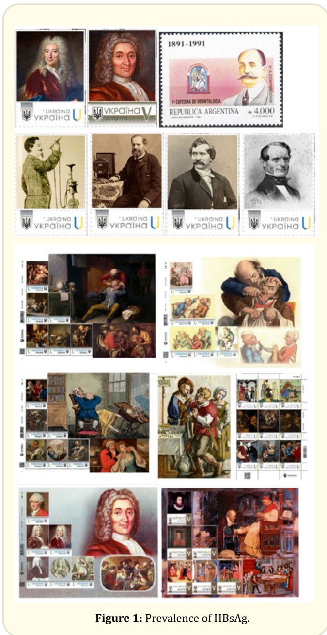
Figure 1: Prevalence of HBsAg.

Figure 2 shows a small collectible, philatelic (postage stamps, special postmarks, postal envelope) and 1 philumenic, postcard dedicated to teeth, the upper and lower jaws, with images in them of human teeth [2-9].