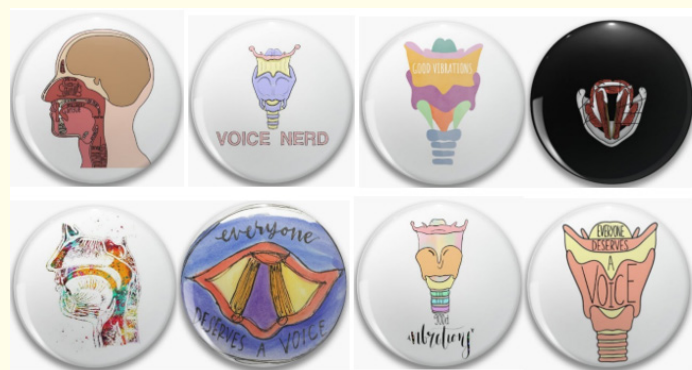
Figure 2: Representation of the human larynx, glottis and vocal cords using thematic anatomical badges.