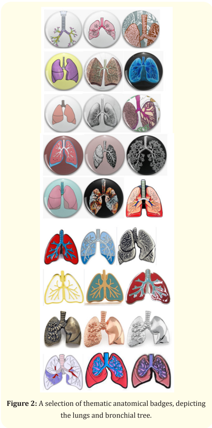
Figure 2: A selection of thematic anatomical badges, depicting the lungs and bronchial tree.

Figure 2 shows a selection of thematic badges, in the amount of 48 copies, depicting the lungs, with possible options, one or two lungs, along with an image of the bronchial tree, sometimes, along with bronchioles and alveoli, and an indication of the lobes of the lung, both right and left [1-5].