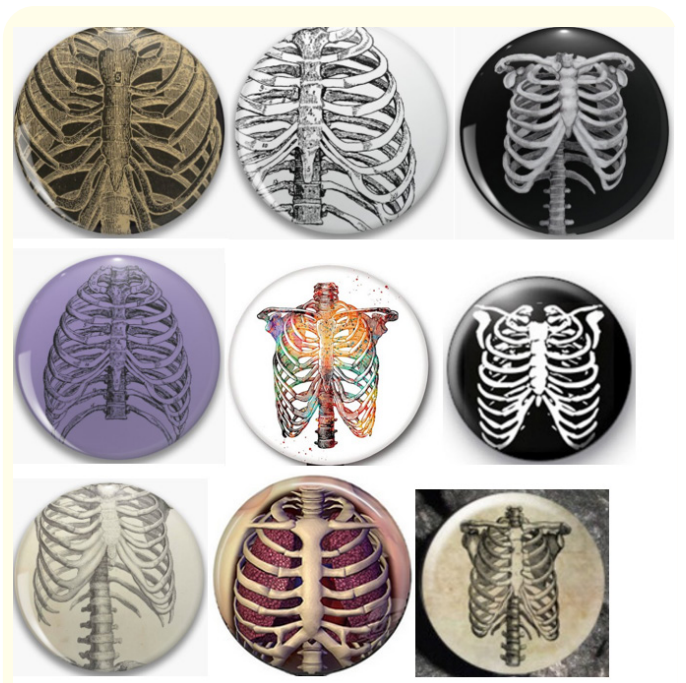
Figure 1: Thematic selection of icons depicting the human chest.