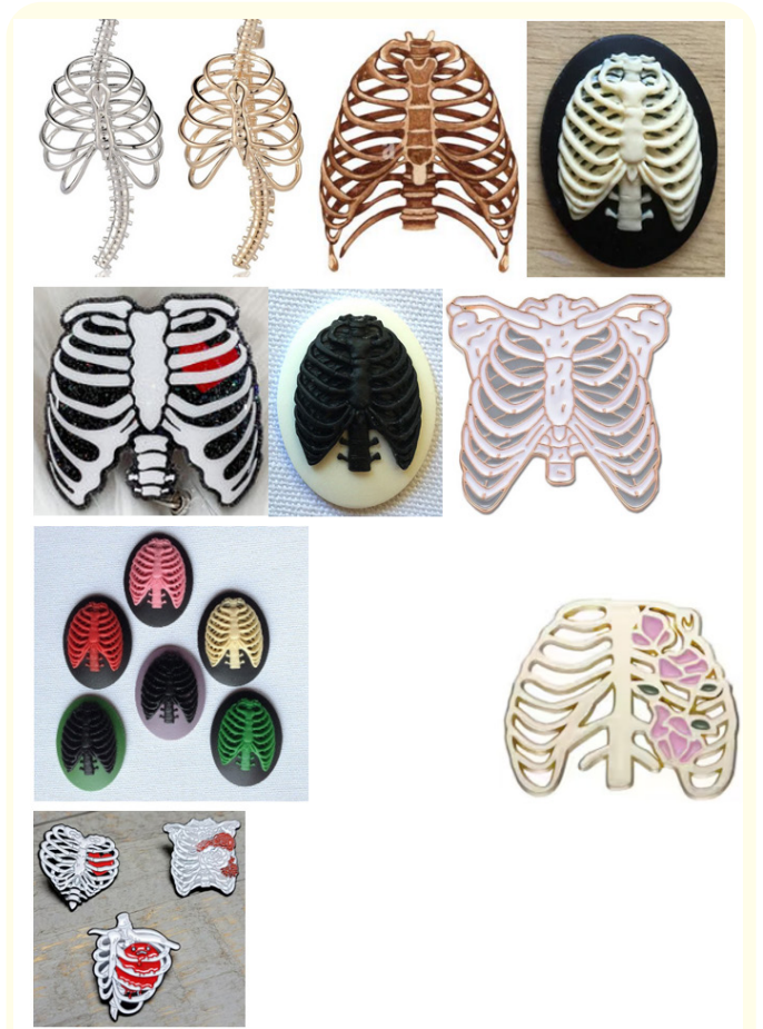
Figure 2: Thematic brooches depicting a human chest.