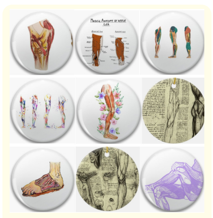
Figure 5: Anatomy of the muscles of the lower limb and its parts.