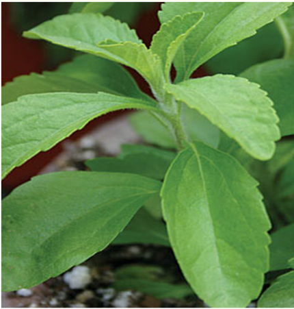
Figure 1: Shows the photograph of the plant leaves "sweet shrub" stevia which is used for the experiment.

In the present case immersion of leaves in a glass vessel containing a suitable organic solvent such as acetone, enables the pigments responsible for their colour to be easily extracted. The extract may then be transferred to an observation tube of suitable length which is held against a brilliant source of blue laser light. The tube with the sample is held in front of the opening end of the optical fibre which is connected to a mini USB spectrophotometer with spectral range 120 - 1200 nm. The spectrophotometer is connected to a laptop and necessary software is installed. Figure 2 shows the LIF spectrum of the acetone extract of the sample stevia and figure 3 shows the LIF spectrum of the acetone extract of the well known plant leaves "Tulsi" for direct comparison.