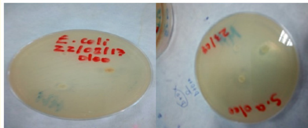
Figure 2: Formation of inhibition halos by the microorganisms used after incubation.

Although it was characterized as a qualitative technique, the halos formed around the discs impregnated with the samples were compared to those obtained by the CIM, as was also done by Gonçalves [16].