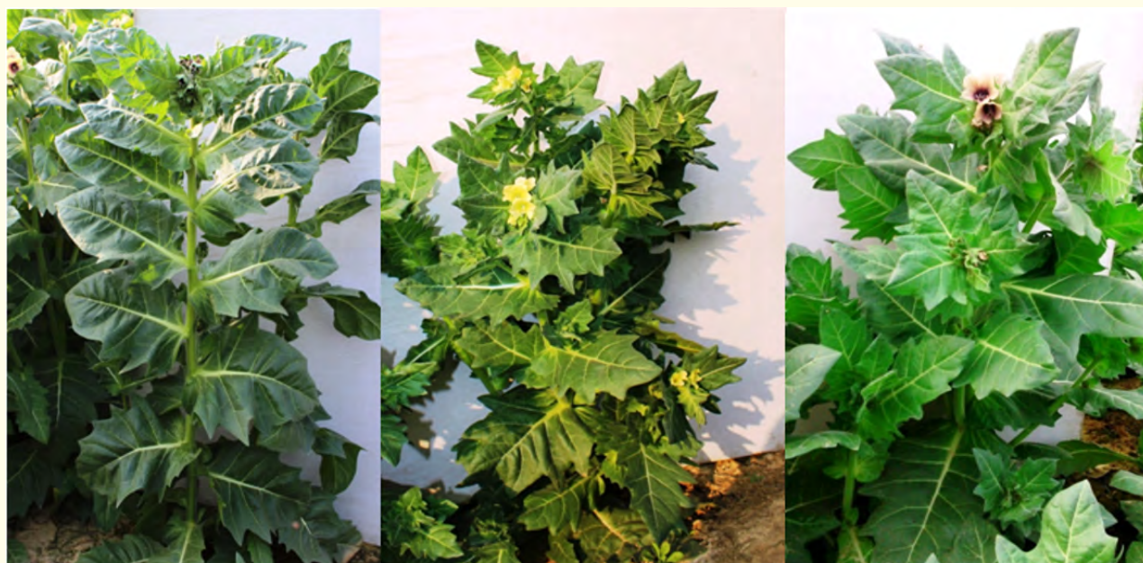
Figure 2: Extreme diversity in Hyoscyamus niger L. accessions.