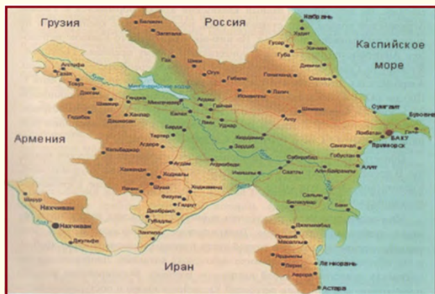
Figure 1: Map of Azerbaijan.

Square of the Republic of Azerbaijan-86.6 thousand km 2 , the population (January 1, 2018)-over 10.0 million. man. Azerbaijan is situated on the western shore of the Caspian Sea. The length of the coast of the Caspian Sea in Azerbaijan is 713 km. Azerbaijan is an important transportation hub of Commerce and of the "Great Silk Road".