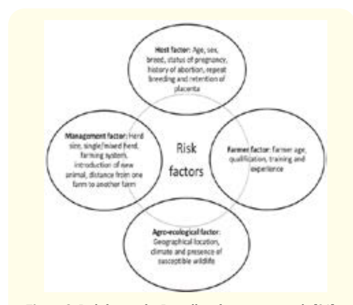
Figure 2: Risk factors for Brucella infection in animals [31].

People who work with animals or with infected blood are at higher risk of brucellosis. Examples include: laboratory workers, veterinarians, dairy farmers, ranchers, slaughterhouse workers, hunters, microbiologists and farmer and also those handling artificial insemination, abattoir and slaughterhouse personnel working in endemic areas are at risk. Brucellae are considered as potential bio weapons [31]. Veterinarians, laboratory workers, butchers, breeders, hunters, and cattle rearing farmers are at high risk of acquiring infection through close direct contact with contaminated biological materials or infected animals and accidental exposure to culture and inactivated brucella cells. Cattle brucellosis in man is most often a disease of occupation [48].