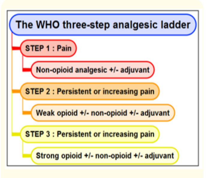
Figure 2: The WHO three-step analgesic ladder [16,17].

cation to reduce chronic pain associated anxiety [12,13]. In Taiwan, based on the National Health Insurance Research Database, drugs that are most frequently used for pain management has been explained (Figure 2)