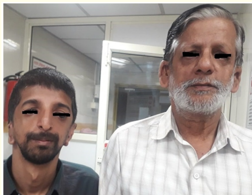
Figure 1: The grandfather is mildly affected; however, father has moderately severe Treacher Collins syndrome.

Born to a Muslim family by non-consanguineous marriage. Grandfather was the first member of his family to have mild Treacher Collins syndrome. He had dysplastic ears for which reconstructive surgery was done. The diagnosis was made only after the birth of his son who had a slightly more severe form of the syndrome (Figure 1).