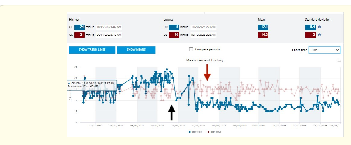
Figure 2: Portal snapshot of patient's IOP measurements of the right eye (blue) and the left eye (red) with the iCare HOME2 tonometer from 6/11/22 to 6/28/23. A black arrow denotes a precipitous drop of right eye pressure around 10/24/22 that corresponds to placement of her tube shunt. A red arrow corresponds to the visit during which the rip-cord suture was removed.

This case illustrates the complex medical and surgical management of an ICE Syndrome patient, illuminated by home tonometry. Previous case reports highlight the severity of glaucoma in ICE Syndrome, that are often poorly controlled by medical management alone [3]. Glaucoma drainage devices are shown to be an effective alternative to trabeculectomy in these patients, where membrane proliferation and PAS can obstruct the filtration site ostium [4]. This finding was confirmed by our patient's diminished IOP fluctuation following placement of a pars plana glaucoma drainage device, as evidenced by her home tonometry readings (Figure 2). In summary, serial home tonometry demonstrated to the clinical team that (1) the patient's PreserFlo bleb had encapsulated in 2020, (2) the postop IOP was appropriately controlled in 2022, and (3) the tube shunt was fully open, underscoring the utility of home tonometry in management of secondary glaucoma.