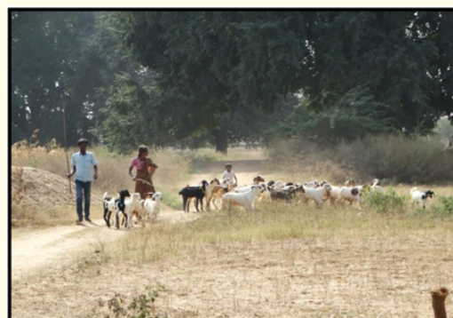
Figure 2: Experimental animals under semi intensive and extensive system of management grazing on nearby field.