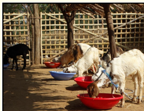
Figure 1: Experimental animals under intensive system of management.

One week prior to arrival of the animals the experimental feeders, waterers and floor were thoroughly disinfected. The goats were housed on mud floor with ample ventilation in and around animal house roofed under coconut leaves and plastic sheet. The standard management practices in animal house along with the traditional management practices of goat rearing outside the house were followed for all groups similarly. Uniform floor space of 1m 2 was provided to all the groups throughout the experimental period. The housing system has been shown in the plate (Figure 1 and 2).