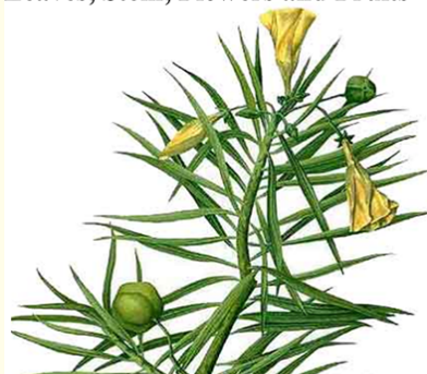
Figure 3: The leaves, stem, flowers and fruits of T. peruviana .

The extracts of stem and bark of the plant have been reported to antipyretic properties. The leaves of this plant contain Flavanones and Flavanol glycosides which are used as antimicrobial agents especially against Cladosporium cucumerinum . The extracts of leaves of this plant have also been found to possess antiHIV-1 RT and antiHIV-1 integrase properties. The extracts of its seeds are reported to exhibit genotoxic potential. In addition, the bioactive chemical ingredients isolated from T. peruviana may be used as fungicides, bactericides, insecticides and rodenticides [12].