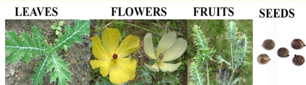
Figure 1: The leaves, flowers, fruits and seeds of A. mexicana .

including India, Bangladesh, United States and Ethiopia. It is a species of poppy [8] and commonly known as Prickly Poppy in English and “pili kateri” in Hindi (Figure 1). Some workers have reported that leaves and seeds of A. mexicana have significant antimicrobial activity. The essential oil of A. mexicana is also found active against some microbial species [9].