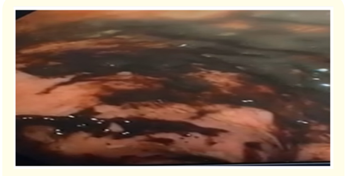
Figure 4: Colonic mucosa lined with red clotted blood.

Biopsies confirmed subacute colitis with non-specific epithelial abnormalities without inflammatory infiltrate; without CMV inclusion. A corticosteroid enema resulted in clinical improvement and no recurrence of bleeding. In collaboration with the oncologist, doxorubicin was halted, and the patient was kept under clinical surveillance with transfusion and corticosteroid enema. A switch to another treatment line was planned upon stabilization of the patient's condition.