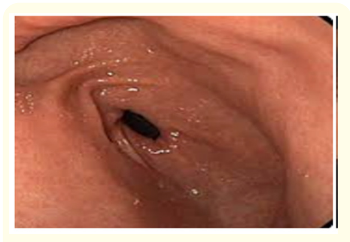
Figure 3: Normal gastric mucosa without bleeding.