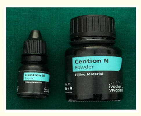
Figure 4: Alkasite Restorative Material (Cention N).