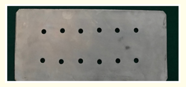
Figure 5: Teflon Coated Stainless Steel Die (8.5mm Diameter, 3mm Depth).