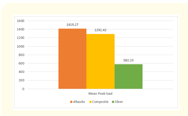
Figure 1: Comparison of mean peak load among the three groups.