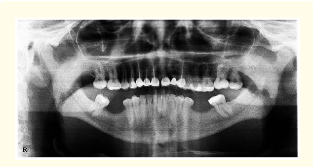
Figure 5: OPG of the Patient with Erythrodermia ichtyosis congenitalis

Radiological examination (figure 4) showed endodontic treatment at 11, 12, 13,14 and 23teeth,extraction of the 22 tooth and the presence of a fixed prosthodontics restoration, because missing tooth is only on one side of the mouth in the upper jaw.