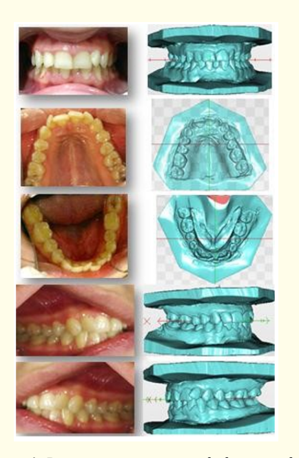
Figure 1: Pre-treatment intraoral photographs.

A 22-years-old male patient in the permanent dentition presented with the chief complaint of irregularly placed upper and lower front teeth. The patient had mesocephalic head type, with a mild convex profile, and competent lips (Figure 3). The patient had Angle's class I molar relationship. Cephalometric analysis indicated a normal maxilla and mandible with proclined upper and lower anterior teeth on skeletal class I jaw bases with normal growth pattern (ANB = 4) (Figure 2). The overjet was 2 mm, and the overbite was 3 mm. The maxillary midline had shifted 1 mm to the left from the facial midline and 1 mm to the left from the mandibular midline. Arch perimeter analysis showed 4 mm of tooth material excess in maxillary arch and 6 mm of tooth material excess in lower arch (Figure 1).