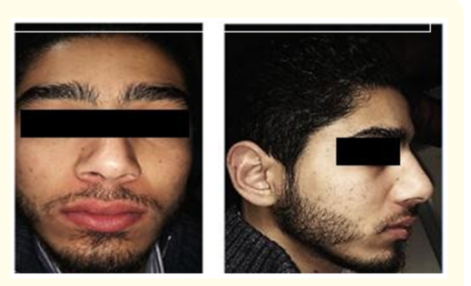
Figure 7: Post-treatment facial photographs.