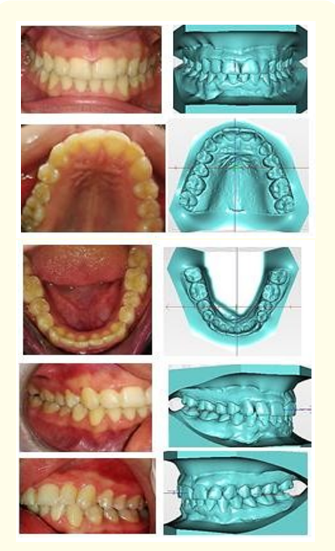
Figure 5: Post-treatment intraoral photographs.

The patient wore aligners for retention over 9 months, and the results remained stable during maintenance and follow up.