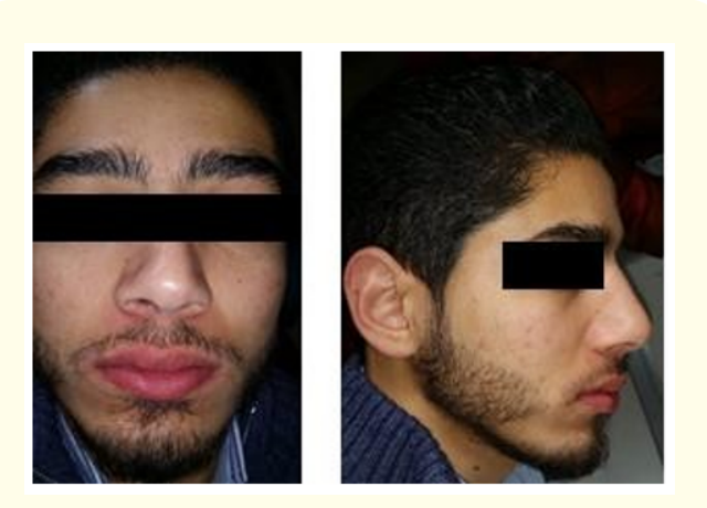
Figure 3: Pre-treatment facial photographs.

Clear Aligners ClinCheck software (computational tooth movement simulation software) can be used for diagnosis, visualization of treatment results, and sharing of information with the patient and dental colleagues throughout treatment [7].