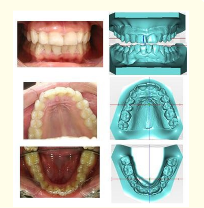
Figure 4: Mid-treatment intraoral photographs while Clear Aligners.

A selective intrusion of upper incisors and correction of canines rotations were achieved (Figure 4).