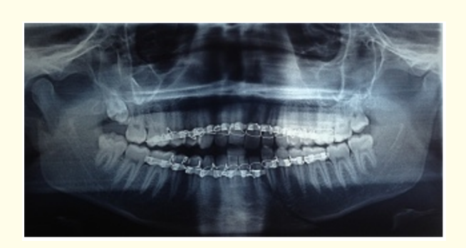
Figure 1: Preoperative OPG.