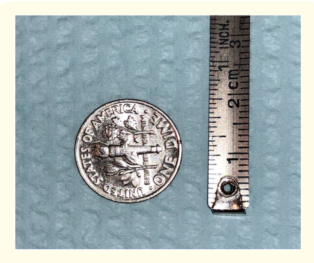
Figure 4: Retrieved coin from nasal cavity.

Dental radiographs can play a useful role in identifying pathology in the head and neck area that may otherwise remain undiscovered. Extra Oral radiographs such as the Orthopantomogram and Cephalograms provides information not only of the jaws and the dentition, but other structures and passages including the airway. This was a case of a relatively benign nature with a successful outcome. However it could have been a more insidious sinister pathology.