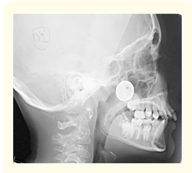
Figure 1: Lateral Cephalogram.

usual in the past. Referral for further evaluation and treatment was made to the otolaryngologist. The surgeon confirmed the presence of the object with endoscopy and was able to remove the object uneventfully as an outpatient. The object was found to be a silver coin 18 mm in diameter (Figure 4). On showing this to the patient he had no recollection of ever shoving this up his nostril or mouth. Orthodontic treatment continued.